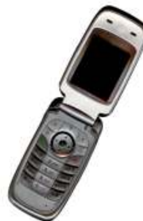
Fig. 3 Example of an image with acceptable resolution