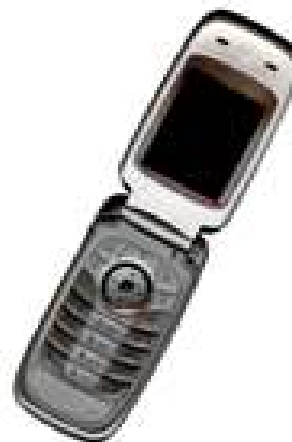
Fig. 2 Example of an unacceptable low-resolution image

must be justified (e.g. Fig. 1). Captions with figure numbers must be placed after their associated figures, as shown in Fig. 1.